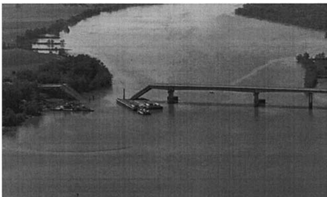
Fig. 2. Overview of damaged I-40 Webbers Falls Bridge

The second method to establish detour routes is to redirect traffic to existing roads in surrounding areas. This method was utilized for the I-40 Webbers Falls Bridge incident. The Oklahoma Department of Transportation (ODOT) established the detour routes for the traveling public using existing highways