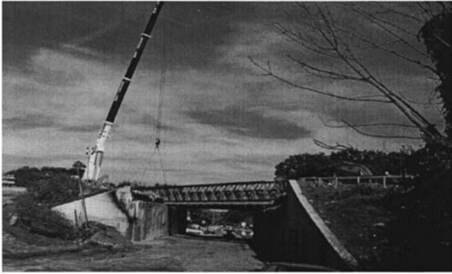
Fig. 4. Two temporary bridges on I-87

because some of the bridge spans had completely collapsed into the river. Due to the large increase of traffic volume on the detour highways, it was necessary for ODOT to take immediate action in the form of heavy maintenance, including overlays on portions of the detour highways, to prevent pavement failures that would endanger the traveling public (ODOT 2002). Several emergency maintenance contracts were issued to resurface highway pavements. In addition, ODOT inspected 42 bridges on the detour routes and performed maintenance work on two bridges.