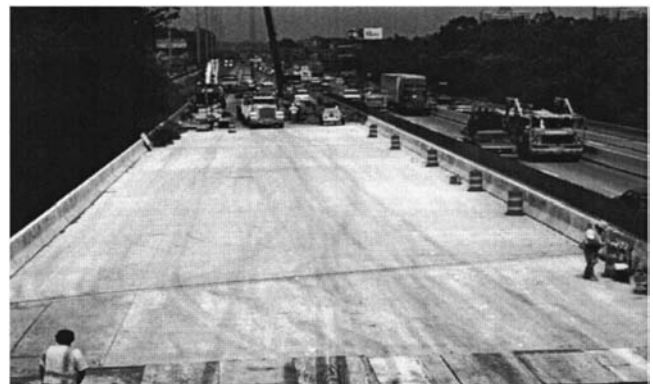
Fig. 3. Newly constructed I-95 bridge deck and detour lanes