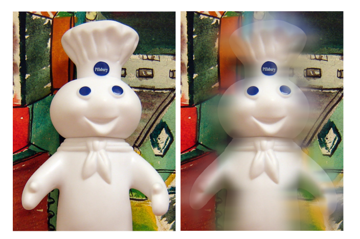
Fig. 6 Drastically reducing apparent depth results in a ghosting effect. Input image (left). Output image (right).

By varying the distances and falloff function, we can manipulate the perceived depth of objects by adding undertones and halos. Fig. 1 shows an example of enhancing perceived depth and Fig. 6 shows an example of reducing perceived depth. Notice that drastically reducing perceived depth results in an interesting ghosting effect. This occurs because target values are propagated from the boundary to every pixel in the image. In this manner we obtain an estimate of the pixel values behind the object. A similar effect can be achieved by performing a cutout of the object, using an image inpainting [3] or texture synthesis [6] approach to estimate the missing