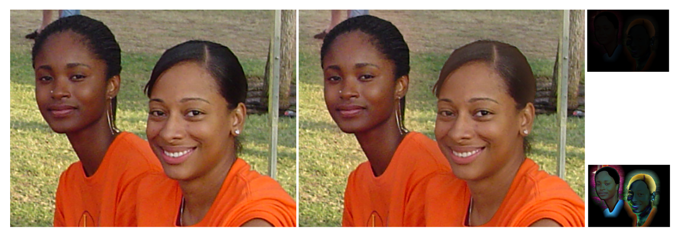
Fig. 7 Combining luminance-based manipulation with color temperature-based manipulation to change the perceived depth of individuals in an image. Input image (left). Output image (right). Difference image (upper right) shows that a warm reddish undertone was added around the face of the girl on the left and that the luminance of her face was increased slightly. A cooler gray-green undertone was added around the face of the girl on the right. Scaled difference image (lower right) emphasizes these changes for display purposes.