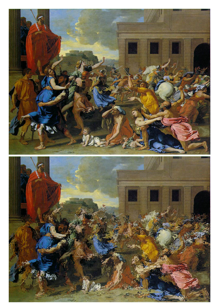
Fig. 9 . Example of applying the illusion of motion technique to a specific region (foreground) of an image. Input image (top): Nicolas Poussin, The Rape of the Sabine Women (1634). Output image (bottom).

Perturbing segments in this manner introduces holes in the image plane. We experimented with various in painting [3] approaches for filling these holes, but found that simply pasting the perturbed segments onto the original image gave better results. Fig. 3 and Fig. 8 show examples of applying this technique over entire images and Fig. 9 shows an example of applying this technique to a specific region of an image.