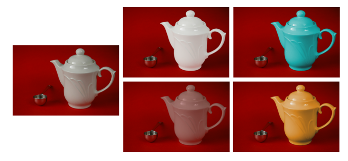
Fig. 5 Manipulating perceived depth by simple color replacement. Input image (left). Luminance target values (middle column). Color temperature target values (right column).