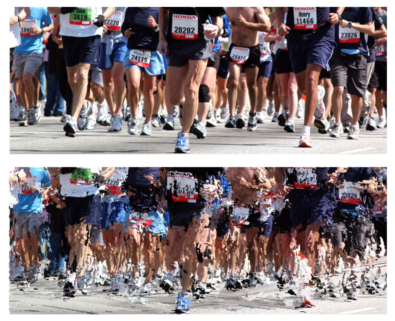
Fig. 8 Creating the illusion of motion by introducing spatial imprecision. Input image (top). Output image (bottom).