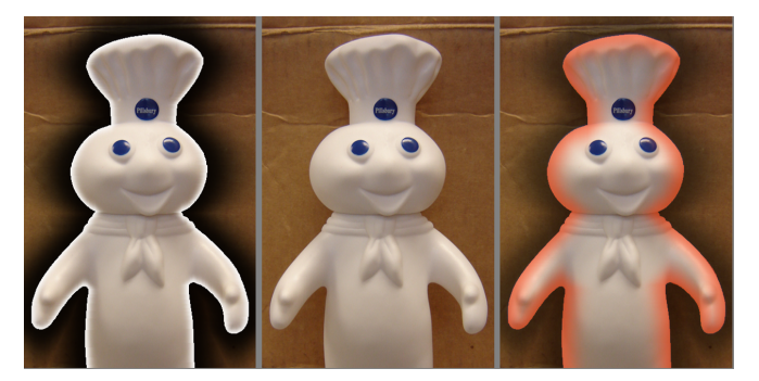
Fig. 1 Enhancing apparent depth using luminance (left) and color temperature (right). Input image (middle).

quite substantial. In fact, many of the visual effects created by traditional artists can now be explained in terms of the features of the human visual system. By tapping into this wealth of knowledge, a new class of image editing techniques which are perceptually meaningful can be developed. We define a perceptually meaningful editing technique as one designed to explicitly trigger certain visual cues. In this paper we present two such techniques - one designed to manipulate the apparent depth of objects in an image and the other designed to introduce the illusion of motion to an otherwise visually static image.