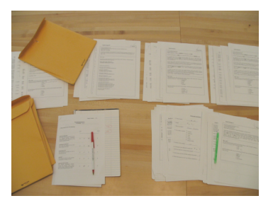
Figure 1: Lo-fi prototype set-up with pens, printouts, table.

Low-fidelity prototypes are important for experiments aiming to encourage participant feedback, because they avoid the impression of a "finished" product [24]. Thus, we used printouts of emails instead of an on-line display. This setup also allowed for flexibility and ease of feedback. Using pens, printouts, and a big table to support spatial arrangements (Figure 1), participants could move papers around to compare them, scratch things out, draw circles, or write on