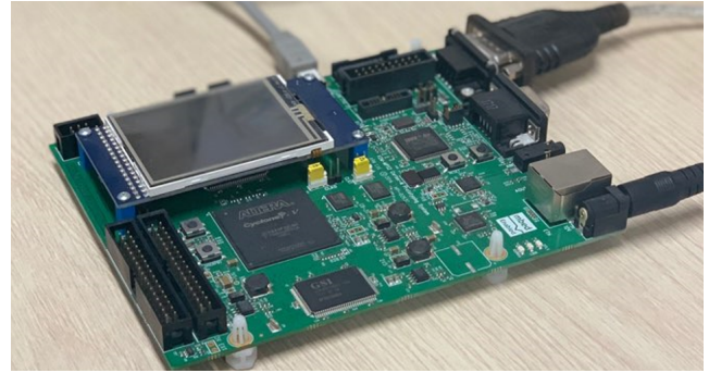
Fig. 2. ARM V2M-MPS2+ FPGA prototyping board

Meanwhile, most of the proposed secure platform was implemented on the V2M-MPS2+, but this prototyping board does not have a memory that can support a secure storage such as OTP memory. Therefore, DUK is hard-coded to implement the 2 nd BL. For this reason, future research will implement secure platform with other boards that can use tamper-resistant secure storage.