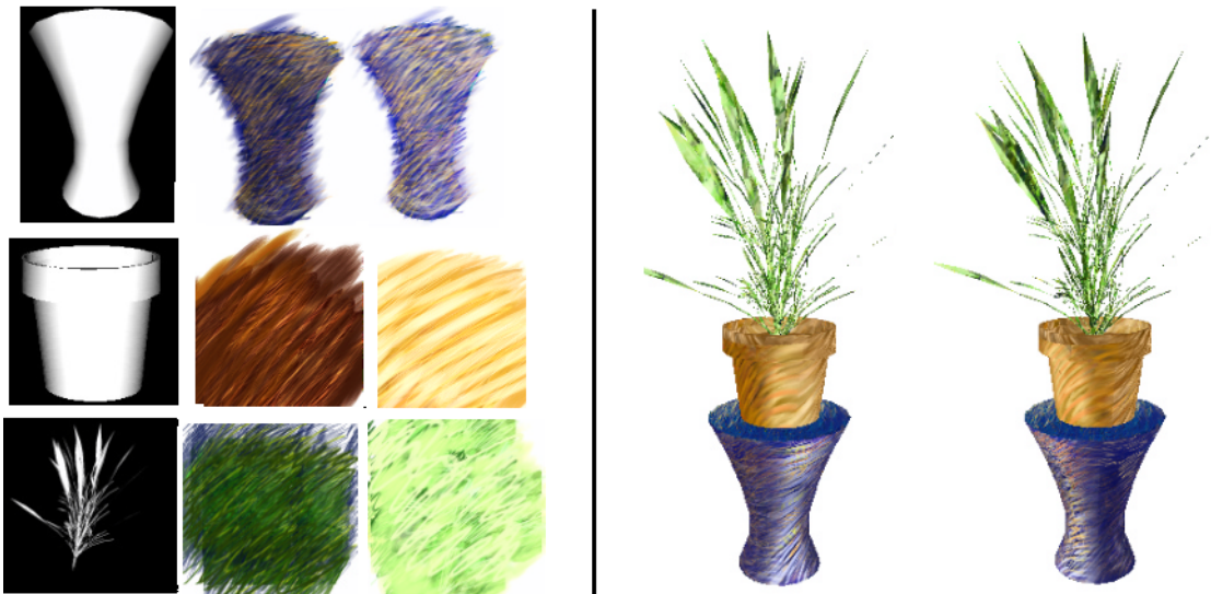
Fig. 5. Painting plants. Shown are example “dark” and “light” paintings for the table, pot, and plant. The images on the far left are the alpha masks for those paintings. On the right is two frames from an animation.