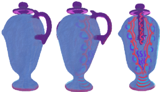
Fig. 3. Left: The vase with just the base-coat. Middle: The angle at which the side view-dependent painting begins to appear. Right: The side view-dependent painting fully visible.

them to the model. The user then moves to the next painting viewpoint and writes out images that show the uncovered portion of the model as a grey scale image, and the covered portion showing the dark (or light) previous painting.