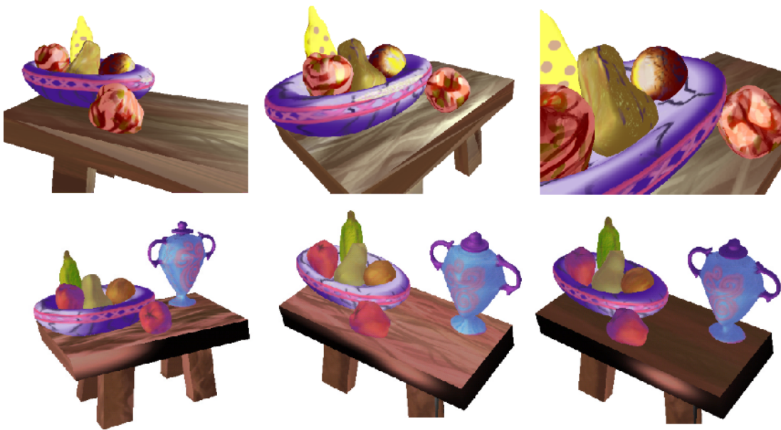
Fig. 4. The entire still life. Each object was painted individually with between 8 and 12 paintings. Top row: Intensity values. Bottom row: Rendered images.