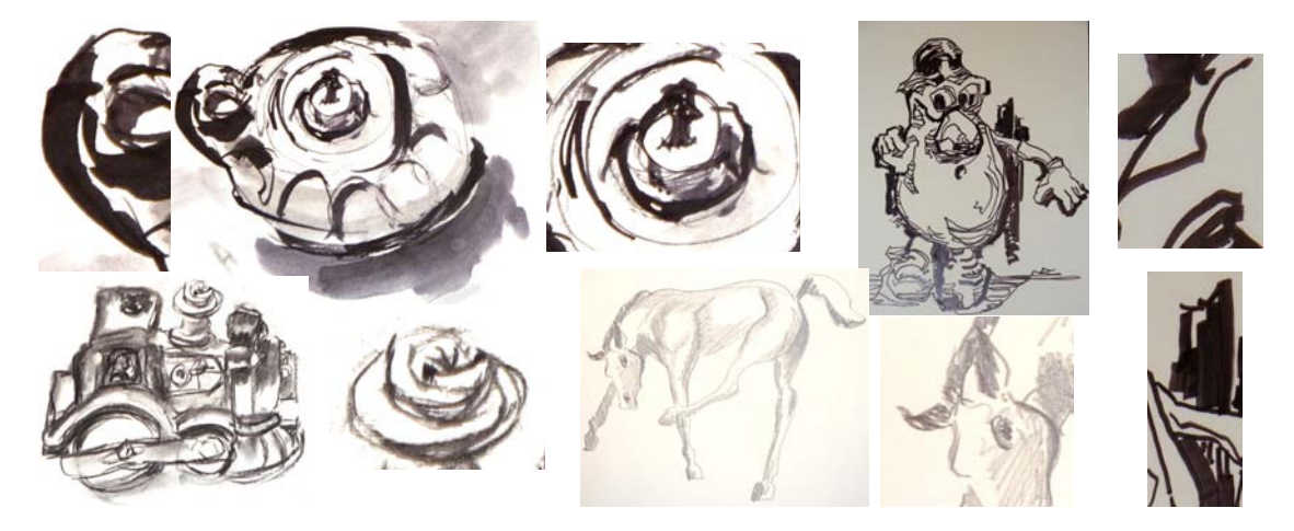
Figure 1: Variation in marks made by a single tool.

After each drawing they were asked leading questions such as "Why did you put that line there?" in order to elicit further information if necessary.