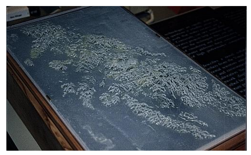
Figure 8: Lightbox with the Lights Off