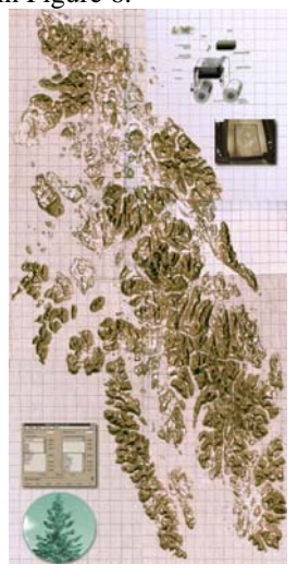
Figure 6: Final Physical Model from the LOM Machine

The desired size of the model was larger than our LOM machine could handle, so the geometry of the STL file was split into four pieces. The resulting physical model, with all four plates connected, is shown below in Figure 6.