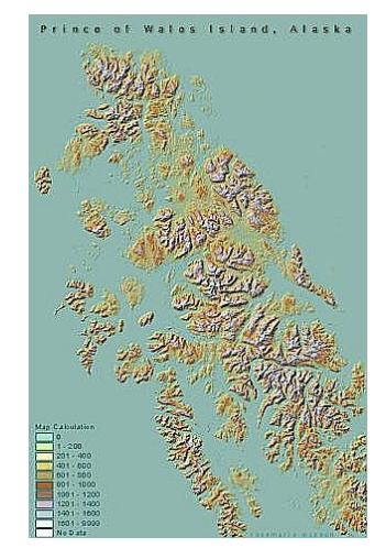
Figure 1: U.S. Forest Service Map