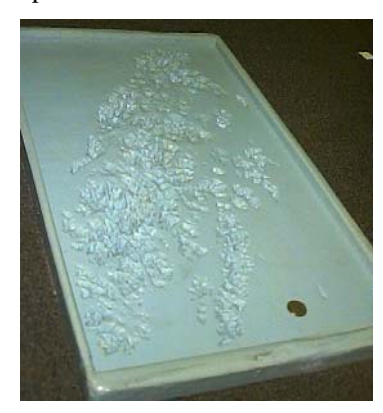
Figure 7: Negative Cast Created from Molding Compound

each other and covered with a silicon mold-releasing agent. A box was built with about an inch of extra room on each side and the plates were placed inside facing up. The bottom of the box was sealed for leaks. We used Por-A-Mold Two-Part Urethane from Synair Corporation, which has a 24-hour cure time. Mold compound was poured to about one quarter inch above the highest elevation on the combined plates. This process created the negative image of the model, which would become the cast to produce the translucent positive. This cast is shown in Figure 7: