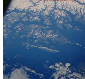
Figure 2: POW Island from Space

The terrain data we used to fabricate the model was obtained from the Alaska Geospatial Data Clearinghouse, a USGS-maintained site. This data forms the substrate of the geographic information system (GIS) database used by the Forest Service. GIS systems are computer-based tools for mapping and analyzing spatially referenced data. They integrate these capabilities with interactive map features. Such maps are typically used for planning strategies and predicting outcomes.