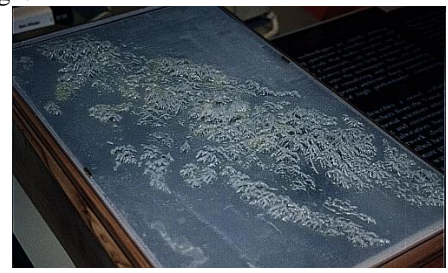
Figure 8: Lightbox with the Lights Off

The results of this experiment are shown in Figures 8 and 9. Figure 8 shows just the terrain mold. Figure 9 shows the lightbox turned on with the data shining through.