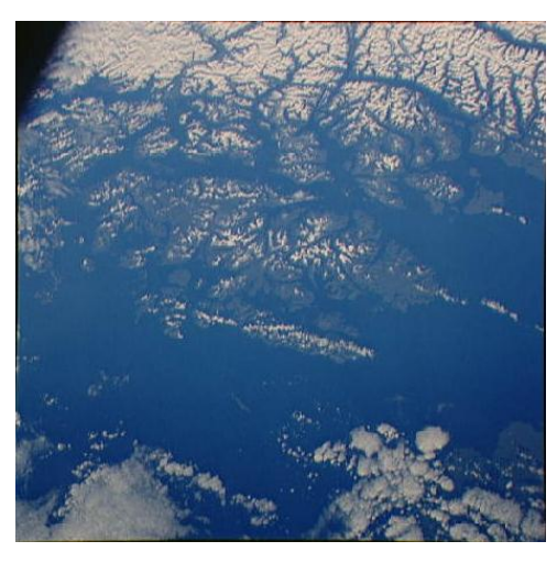
Figure 2: POW Island from Space