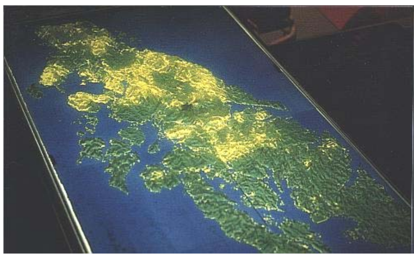
Figure 9: Lightbox with the Lights On