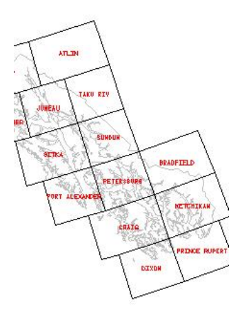
Figure 3: Individual Panels Combined into a Complete Dataset

In order to compile a terrain data set for POW that could be used for the 3D model, we had to merge seven USGS quads (Figure 3): Port Alexander, Craig, Dixon Entrance, Petersburg, Bradfield, Ketchikan Canal, and Prince Rupert. The data resolution was 1:250,000 with a total of 3603 x 3603 elevation values for the combined 7 quads.