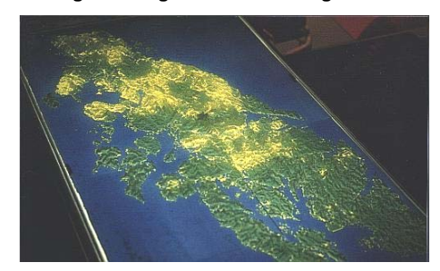
Figure 9: Lightbox with the Lights On