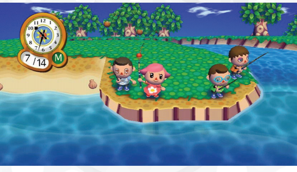
This is done with a vertex shader-the world is flat!