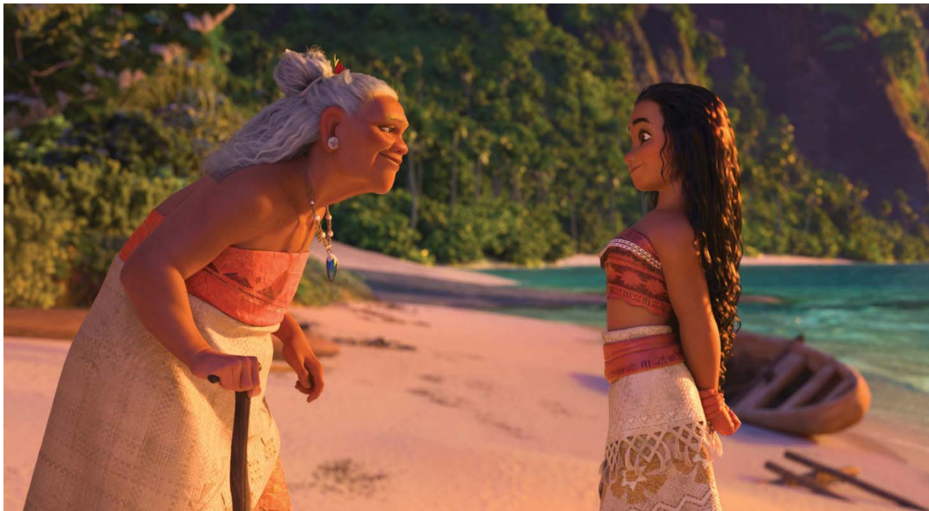
COMPLEX VEGETATION, WATER, LONG HAIR, AND MULTI-LAYERED COSTUMES REQUIRED MASSIVE AMOUNTS OF PROCESSING TIME.

"It's a two-character shot of Moana and Maui on the boat, seemingly an acting shot," he says. "But we talked about how we could execute the effects in that shot for a half an hour. Because of where they are, it was complex. We start with them dry, and then they get wet. They're on a boat. They're next to water. They interact with the water."