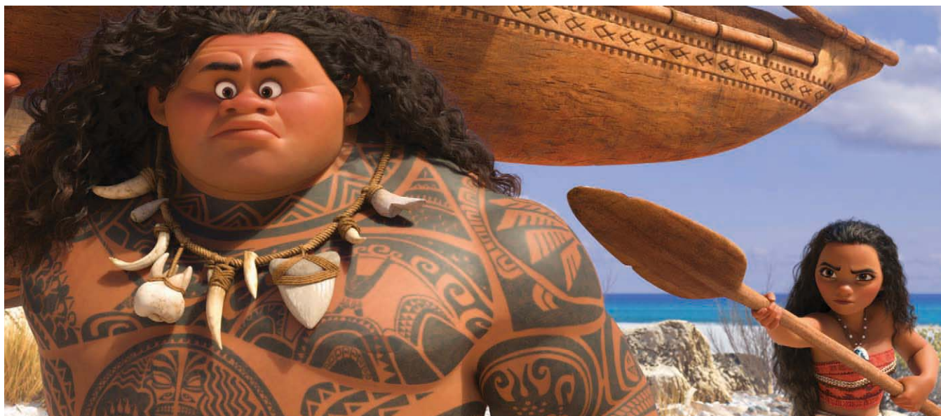
MAUI'S VARIOUS TATTOOS SOMETIMES COME TO LIFE THROUGH 2D ANIMATION.