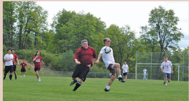
In an epic soccer match at the base of scenic Mt. Shasta, Stanford defeated OSU 4-2.

at the hotel and presented posters explaining our research and fielded questions from the opposition.