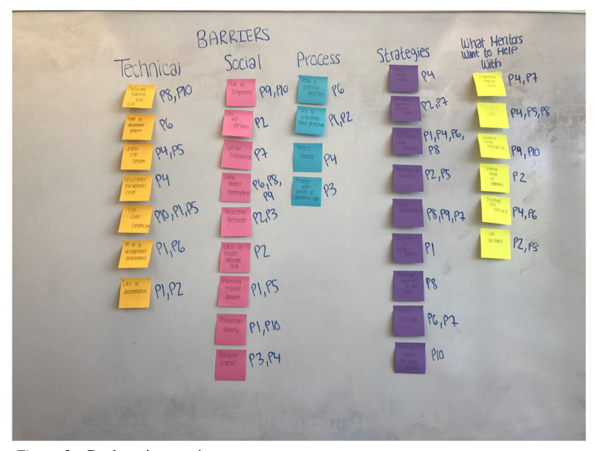
Figure 2. Card sorting session