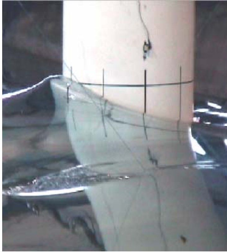
Figure 5. An image of the preliminary experiment for tsunami force on a vertical cylinder. The size of the cylinder is 0.5m in diameter in a water depth of 0.8m.