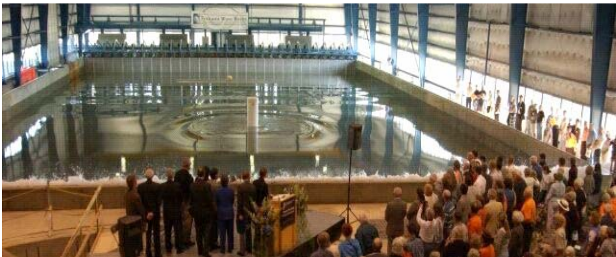
Figure 2. The Oregon State Wave Research Laboratory NEES Tsunami Wave Basin.