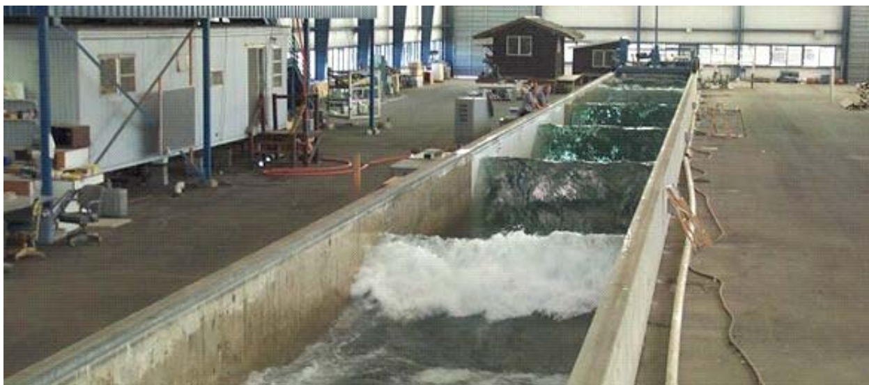
Figure 4. The Oregon State Wave Research Laboratory Large Wave Flume.