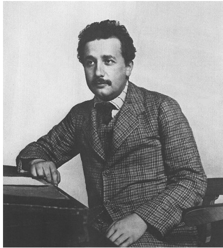
Fig. 1. Einstein as a Swiss patent clerk in 1905 when he revolutionized fundamental physics through the creation of the special theory of relativity.

While Lagrange was obviously envious of Newton's lucky opportunity, we detect little sentiment of a similar nature in what Einstein had publicly said of Newton: