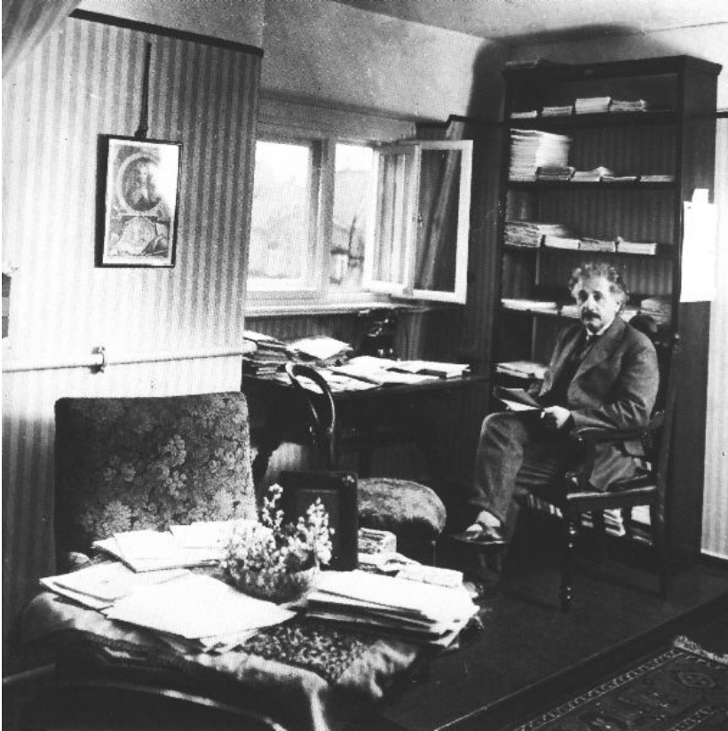
Fig. 3. Einstein in his study in his home on Haberlandstraße in Berlin.

in the history of mankind. The grandeur of its conception, its beauty, its sweeping scope, its spawning the awesome science of cosmology, and the fact that it was conceived and executed by one single person, reminds me of the act of creation in the old testament. (And I wonder whether Einstein himself had thought of this comparison.)