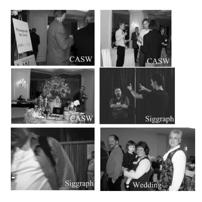
Figure 2: Example photos the robot took. Images on the left are examples of poor composition, images on the right are some of the better ones. The camera used at SIGGRAPH was a 640x480 video camera, the others were taken with a Kodak digital camera, mounted on top of the video camera.

In the environments in which the robot was meant to be inconspicuous it blended into the background surprisingly well. As a result, many more candid shots of people talking and interacting with each other were taken, which was one of the goals of the project. At SIGGRAPH, when people were attending to the robot much more strongly, the great majority of shots were frontal, semi-posed shots, often with a "deer in the headlights" quality. Most of the candid shots occurred when the subject was being distracted by one of the students who was explaining how the robot worked. Figure 2 shows some example pictures taken at the different events.