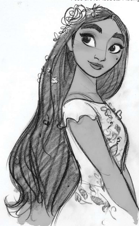
Pose art for Isabela Madrigal.

She notes, "When we infused magical realism into our story of this family and thought about those encantos , everything