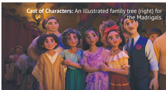
Cast of Characters: An illustrated family tree (right) for the Madrigals.

the Pooh, Wreck-It Ralph, Zootopia and Ralph Breaks the Internet, explains, "What's so impressive is that we're following 13 characters with 13 different designs, that have 13 different hairstyles and clothing designs and textures. There's a reason why oftentimes in animation you might find stories that are buddy stories, where at some point in time two or three characters maybe go off on a journey themselves: Because it's easier and more contained. But in this case, we had to track 13 characters on screen. You can't just have them completely disappear. So, it was critical that we had to achieve this level of complexity that we'd never done before."